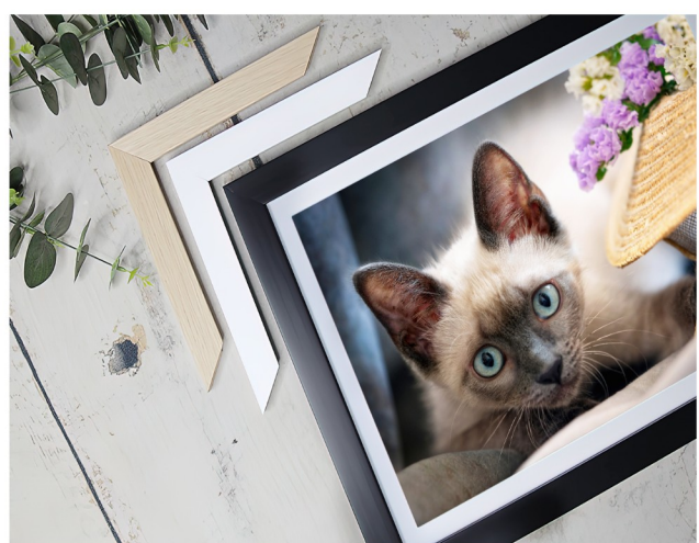
Main picture: Luna, the Dad Protector. Canvas picture: Karisma (Karrie), a Koolie. Framed fine art picture: Mixi (pronounced Mishy), a siamese kitten who was fascinated by the camera shutter.